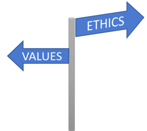
Ethics and Values in Medical Affairs