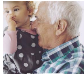
Benefit to patients